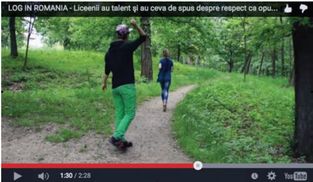
Gender-based violence storified. Screenshot of an award-winning video from the LOG IN project. 24