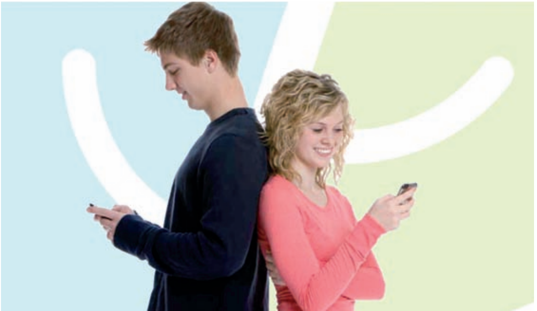
Gender-based violence and responsible use of social media. Cover of a booklet for the LOG IN project. 20

of local authorities and multistakeholder support from three countries: Cyprus, Italy and Lithuania.