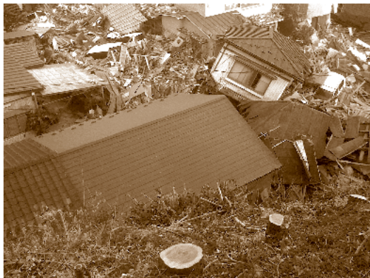
Homes that were washed away and ended up at the foot of a hill where we stayed at my friend’s house. No search and rescue operation had been performed there yet after three weeks, on 3 April 2011.

To be frank, it was not easy to organise all of this work with limited resources. However, iSPP managed to develop some of the projects.