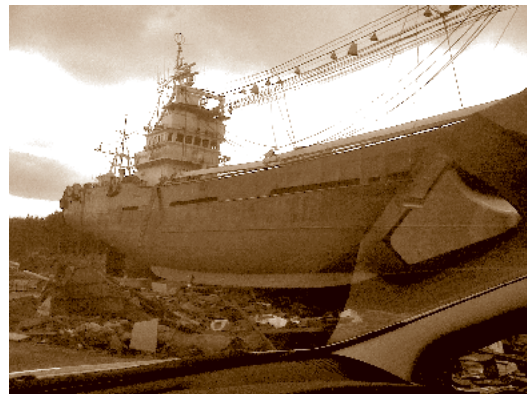
A large ship landed 700 metres away from the pier (picture taken 3 April 2011). You can see the same ship from a Google Earth photo: 38°54’56.99”N, 141°34’51.10”E