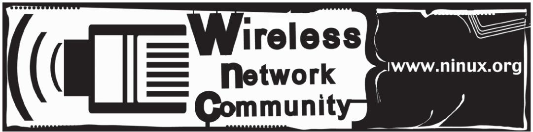
The sticker promoting the early ninux community network.

list and meetings. The motivations for joining the community ranged from socio-political reasons, to helping to bridge the digital divide, a desire to learn by doing, down to pure curiosity.